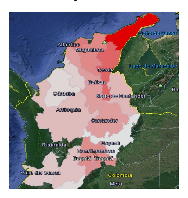
Figure 2. Departments where climate migrants move in Colombia for the second week of January 2014.

Regarding where those climate migrants go, 90% of them stay in La Guajira relocating to other municipalities where access to help, food and water is probably easier. The other 10% move to other departments. In general, the closer the department to La Guajira the higher the number of people relocating is, i.e. climate migrants move to neighboring departments, with the exception of Bogota. Figure 2 presents in a red color scale where the migrants move from the second week of January 2014.